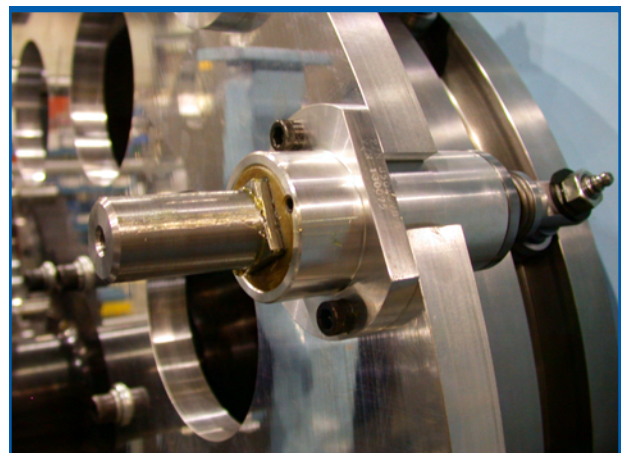
Close up of square clamp rod and slide housing bushing