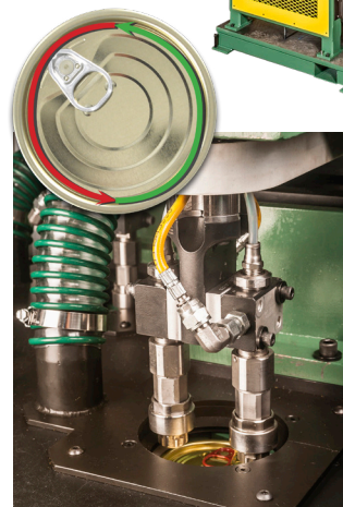
Servo-driven oscillating spray head reduces coating usage and machine maintenance