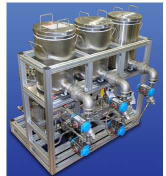
Optional auto mixing system ensures accurate coating mix