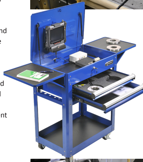
LEFT: The complete kit is packaged in a rolling tool box for ease of use at the bodymaker