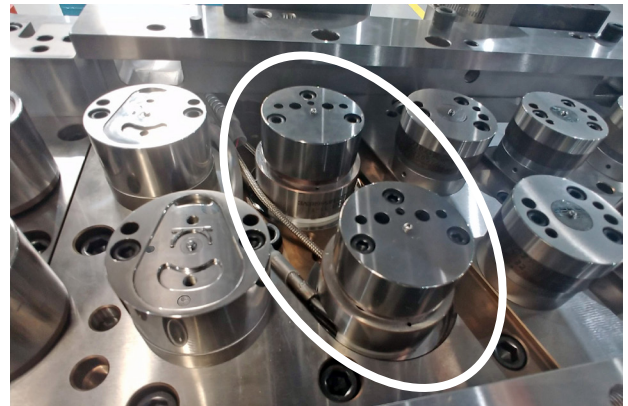
Thermal score anvils installed in a lane die of a Tetrad beer-beverage EOE conversion system