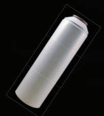
First High Speed D&I 2 Piece Aerosol Line