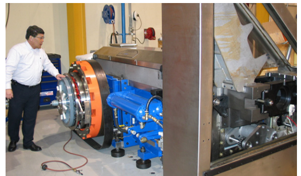
Goizper clutch-brake unit installed on a new Standun B6 Bodymaker