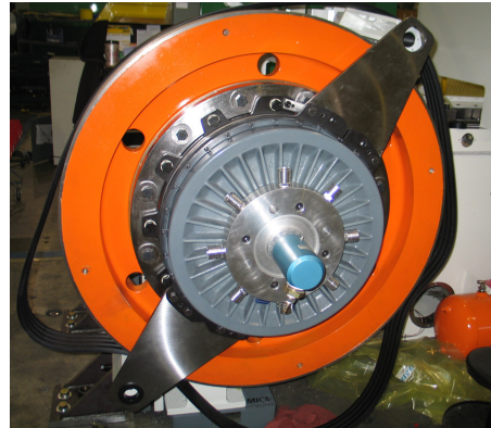
Goizper clutch-brake / flywheel unit for the Ragsdale Bodymaker

For more information and pricing on the Goizper clutch-brake/flywheel retrofit for Stolle Ragsdale and Standun Bodymakers, please contact Stolle CMD at 303-708-9044 or cmd.info@stollemachinery.com .