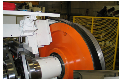
Rear and side views show how the clutch-brake unit is mounted on a Ragsdale Bodymaker frame